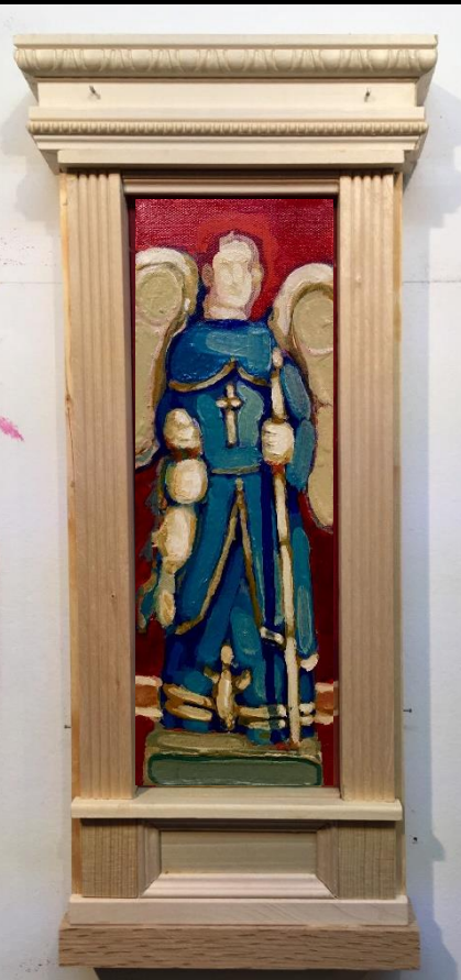
Right: San Ramón Nonato and San Rafael Arcángel - acrylic on canvas 12x4

Retablo Frames are handcrafted from stock wood moldings in the studio to fit the odd sized small canvas.