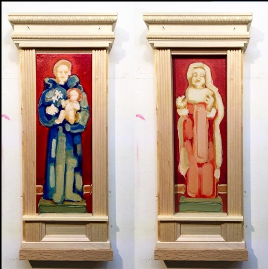
Left: San Antonio de Padua and Virgen del Carmen—acrylic on canvas 12x4